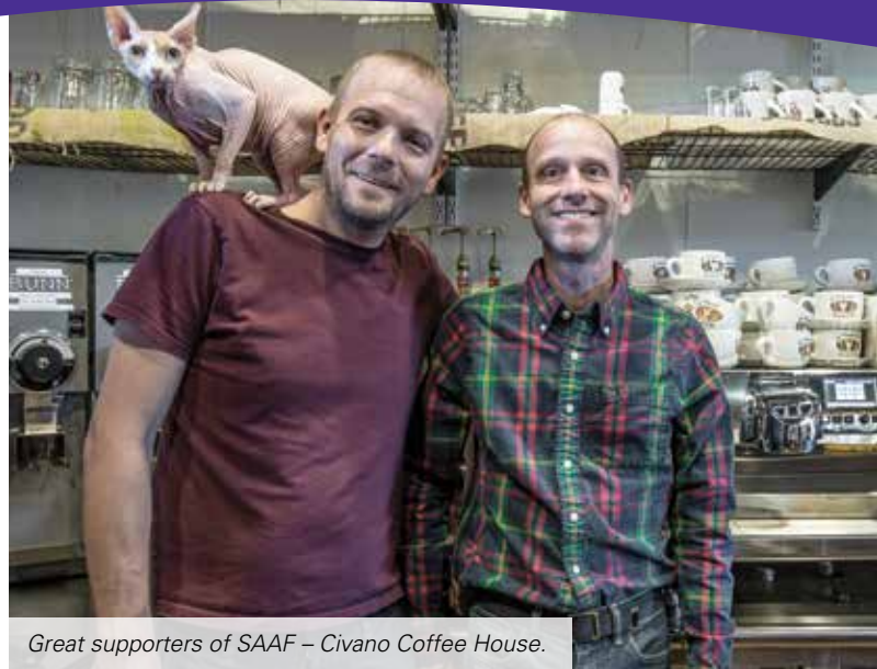
Great supporters of SAAF – Civano Coffee House.

The following is a listing of all corporate, foundation, and non-profit organizations who have helped support SAAF during 2017 with cash gifts. Please consider supporting these businesses as they have provided essential services and programs for the people SAAF serves.